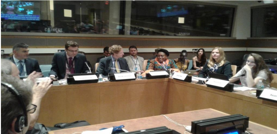
JONAPWD president presents at a roundtable by Stakeholders Group on Disability organized by International Disability Alliance