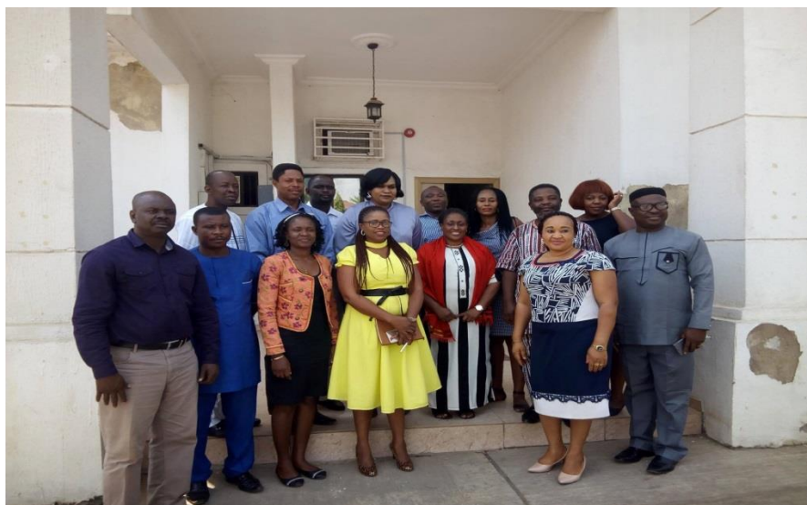
Group photo on JONAPWD's visit to National Health Insurance Scheme

The coordinator promised to start a pilot programme on the inclusion of PWDs in the NHIS with Karamajiji district, off airport road Abuja, this pilot programme has since started and implementation is ongoing.