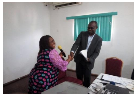
JONAPWD President with Country Sightsavers Nigeria