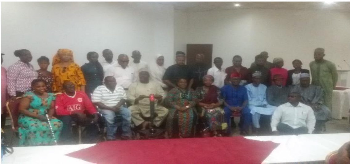
Cross section of participants.