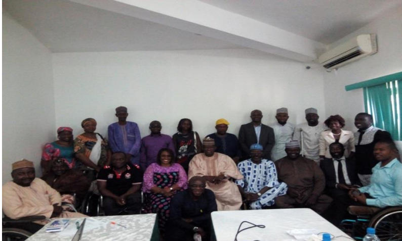
JONAPWD Stakeholder's meeting on the SDGs supported by Sightsavers -Nigeria